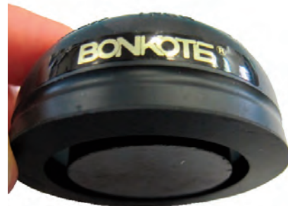
This Magnet can be fixed at the bottom of the Cleaner