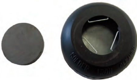
The Fine-Cleaner consists out of a High temperature rubber part and a Magnet