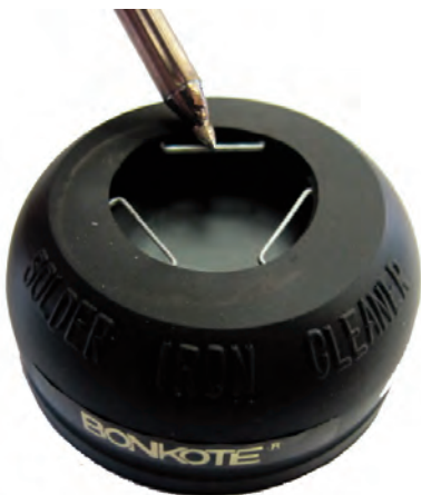
Strong residues can be pre-cleaned or cleaned at the rounded stainlessbars.