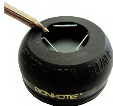
Simple residues can be cleaned off the tip at the rubber lip