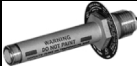
Fenwal heat detector