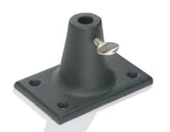
# 11463 Screw Down Fixture