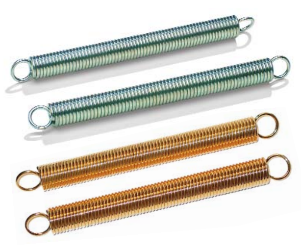
Springs made from music-steel