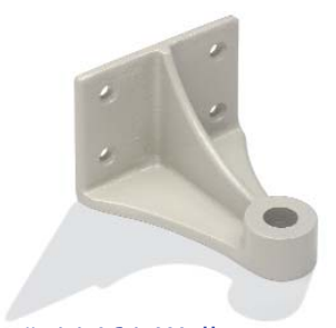
# 11461 Wall mount