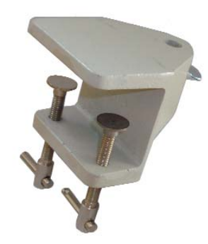
# 11464 Heavy Duty Table Clamp, double wide