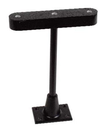
# 14111, Triple Riser 30 cm