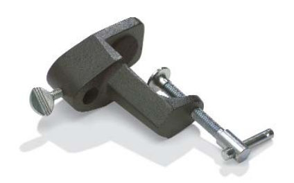
# 11461 Table Clamp Std