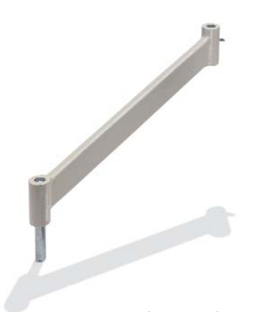
# EB1, diagonale Riser 30 cm