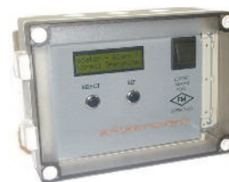
Alarm Point Distance locator