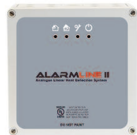
Analogue LHD Control Unit: Self Programmable