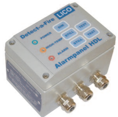
LICO Alarmpanel to control Alarmline Digital LHD cables