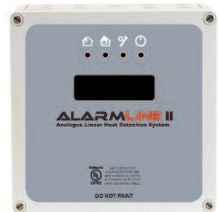
Analogue LHD Control Unit: Self Programmable